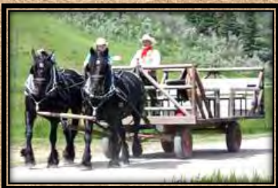
The Percheron Team