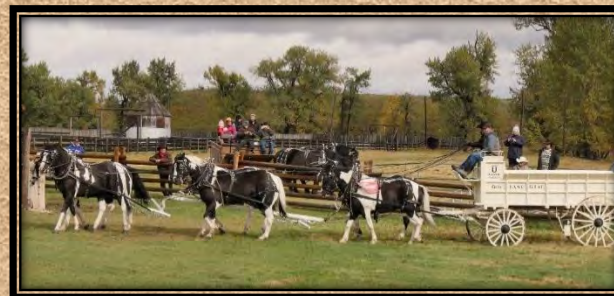
Six Horse Hitch

The Friends of the Bar U work in the spirit of cooperation with PARKS CANADA to help promote public awareness and appreciation of the traditions that developed the Alberta West.