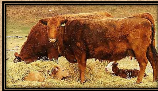
The Bar U Cattle