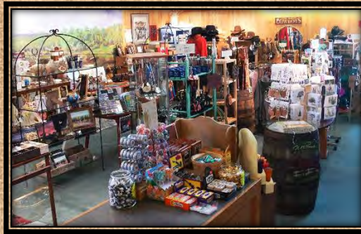
FRIENDS OF THE BAR U Gift Shop