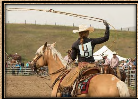
Old Time Ranch Rodeo