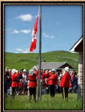
Canada Day Celebrations