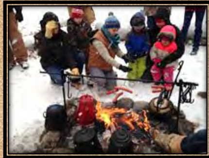
Kids Old Fashioned Christmas Party