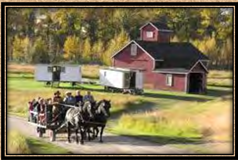
Wagon Rides on the Ranch