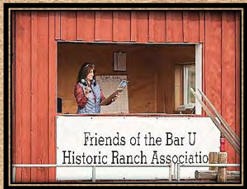
From the Announcer's Booth